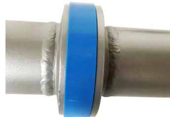
Hubs, O-Ring and locating ring assembled