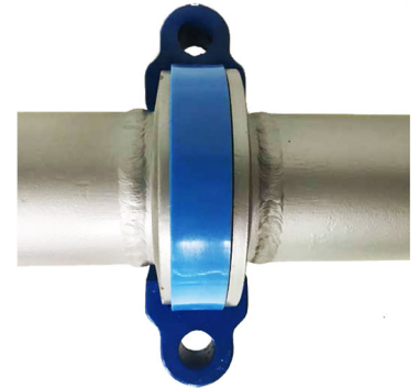
1 x half clamp assembled with hubs, O-Ring and locating ring