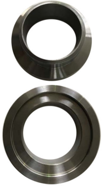
Butt welded hubs