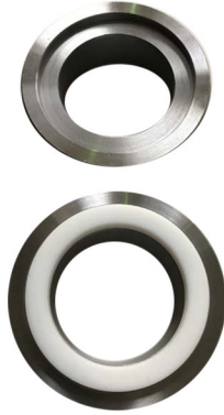
Butt welded hubs & compression seal