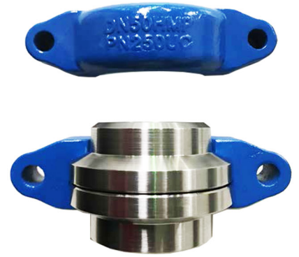
1 x half clamp with hubs assembled