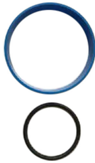
Locating ring & O-Ring (seal)