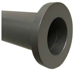
Plain ended butt welded hub, welded to pipe