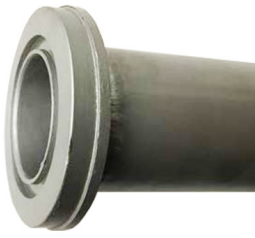
Grooved butt welded hub, welded to pipe